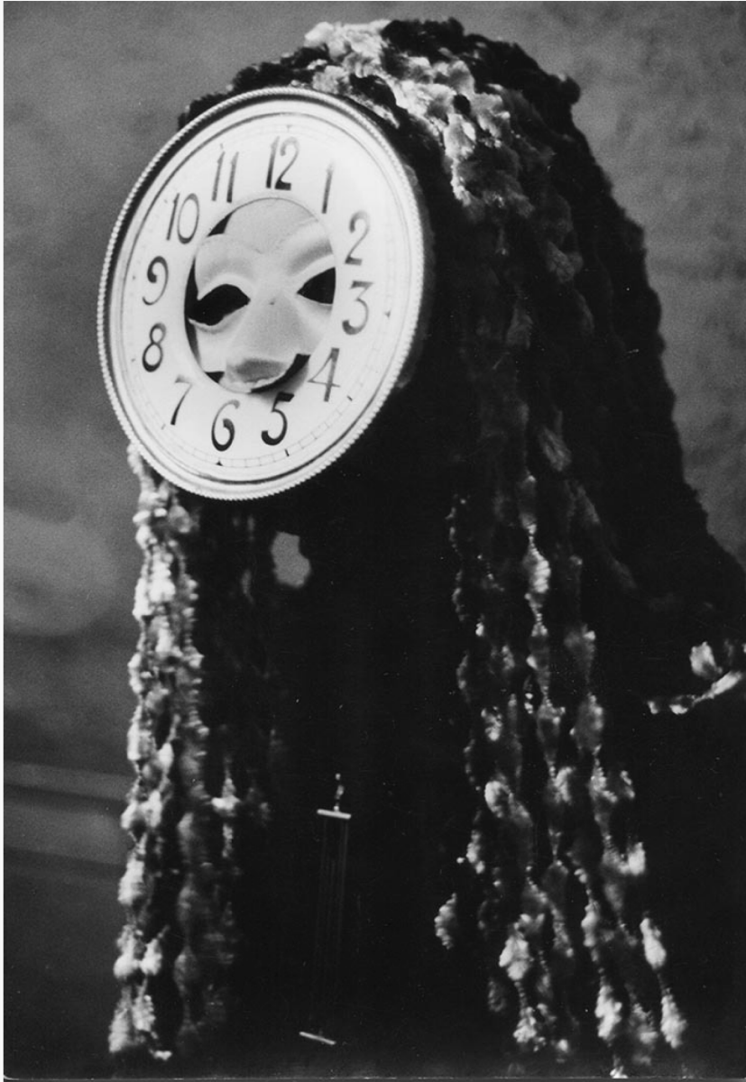
Art Décor: Masked ball, 1961