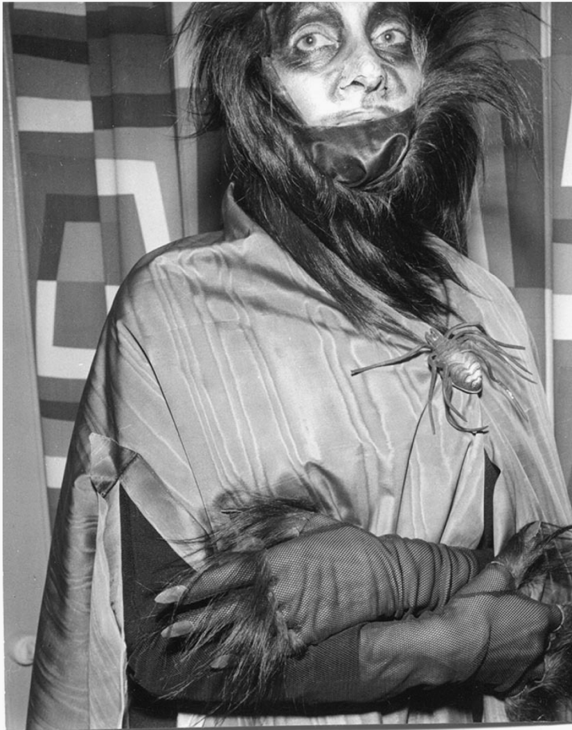
Art Décor: Méret Oppenheim at a masked ball, 1958