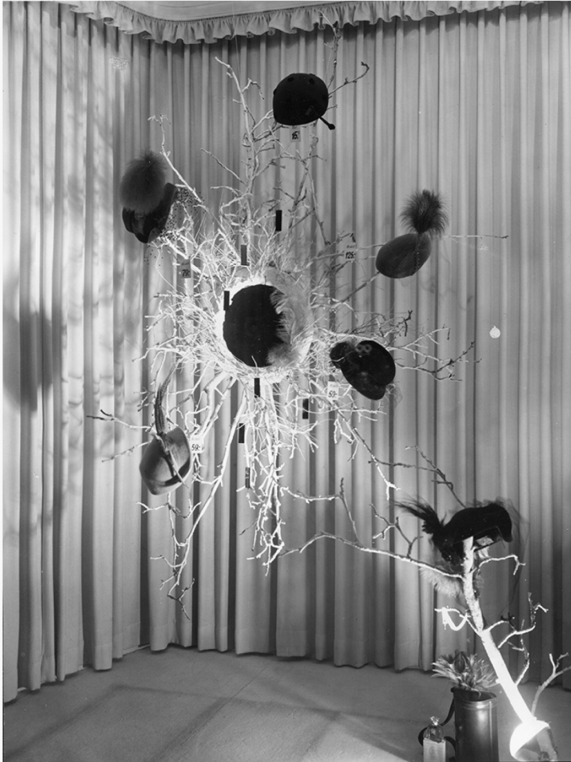
Art Décor: Loeb department store, 1952