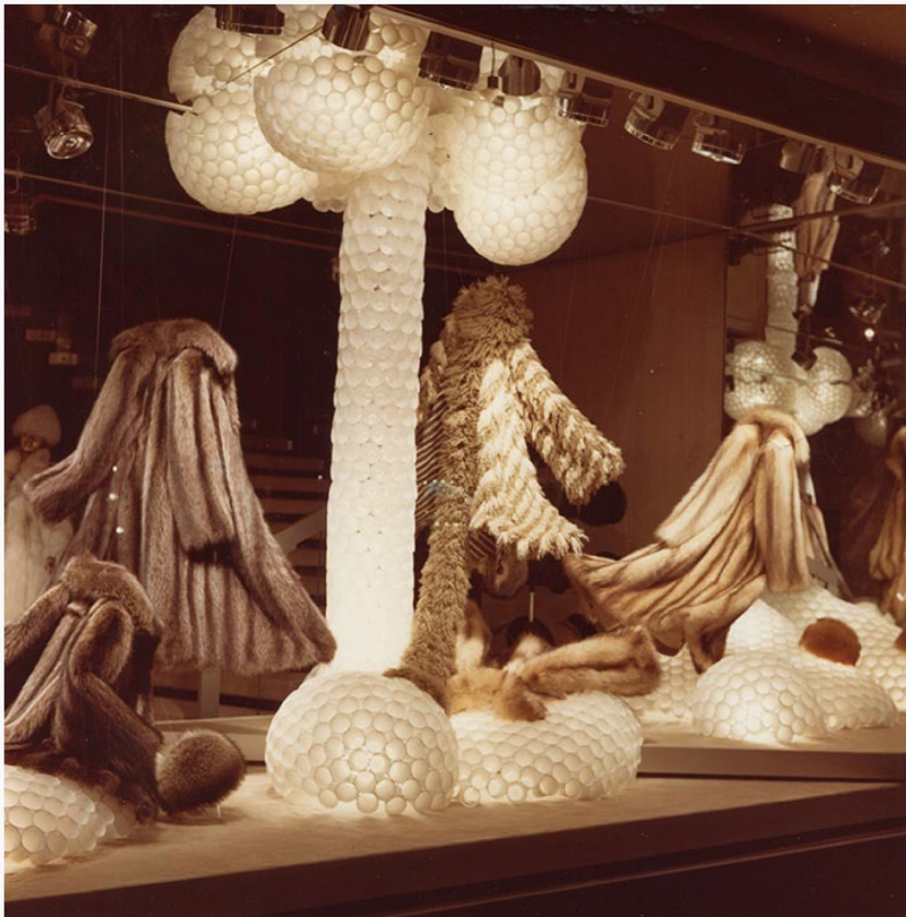
Art Décor: Büchler Furs, 1980