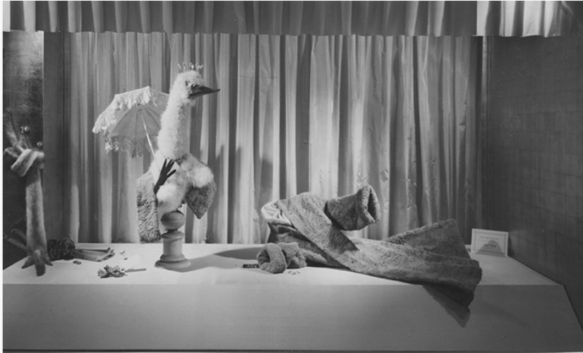
Art Décor: Roth Furs vitrine, 1956